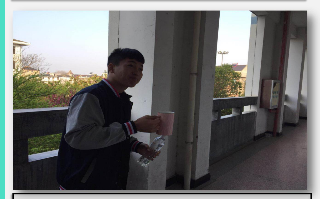
■ Add the exact purpose/time/places...etc