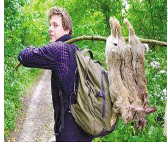
Tom the hunter prey