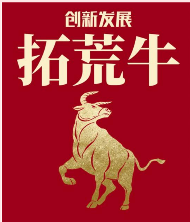
The pioneering ox: To seek innovation and development