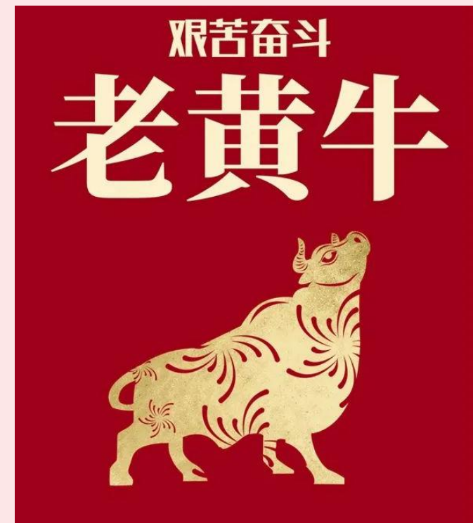
The persisting ox: Hardwork and the willingness to endure hardships