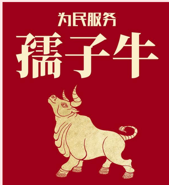
The serving-the-people ox: The selfless commitment to the good of the people

Going forward, we must exert ourselves to strive bullishly without being cowed by any problems with the “ three ox spirit ”: