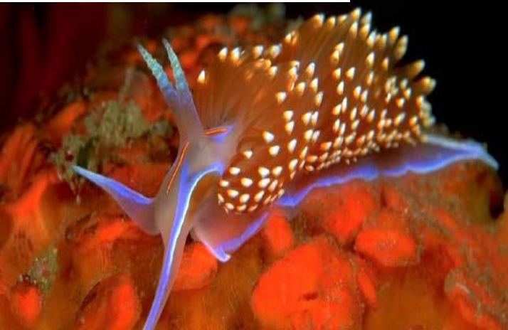
sea-slug 海参; 海蛞蝓