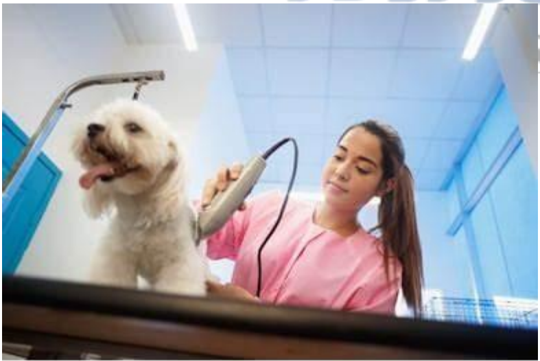
work part-time at shop