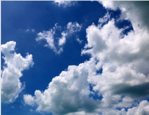
float ing clouds