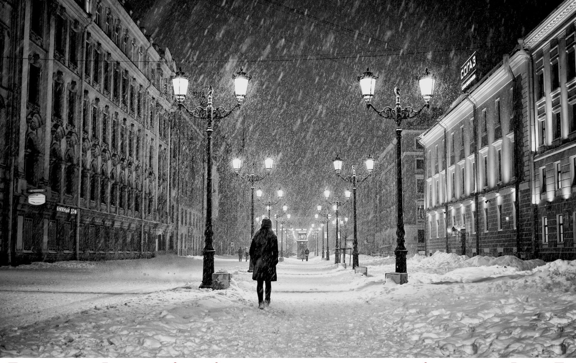
It started snowing just as we were setting out, but I felt warm, my heart melting.