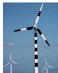
a stripy wind turbine