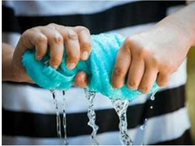
squeeze the water out