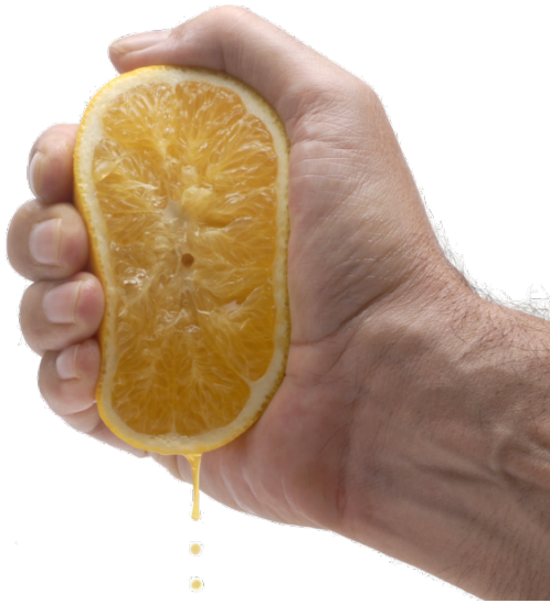
squeeze orange juice