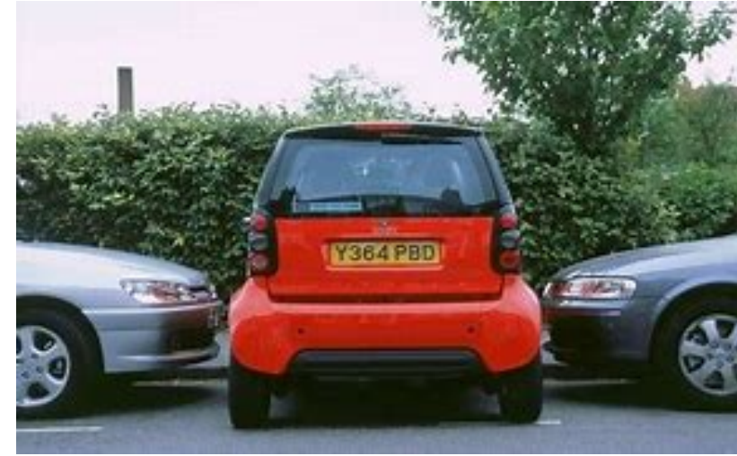
squeeze into a parking space