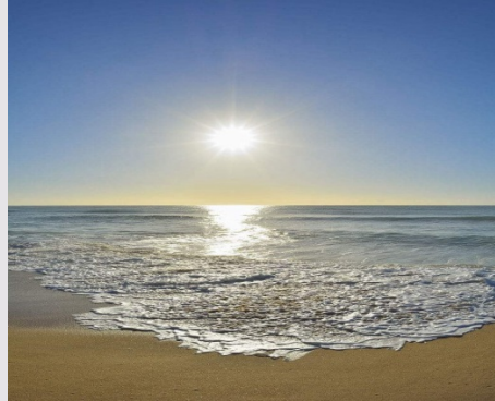
g listering water