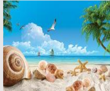
s cattered seashells