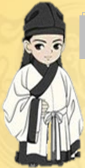
Li Wei 李为

After his death (die), the people of Chu crowded to the bank of the river to pay their respects (respect) to him. The fishermen sailed their boats up and down the river to look for his body. People threw zongzi and eggs into the water to divert possible fish or shrimp from attacking his body.