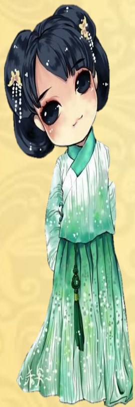
Li Hua 李华

patriot /'pætriət/n. 爱国者 rejuvenation /ri,dʒʊvə'neifən/ n. 复兴