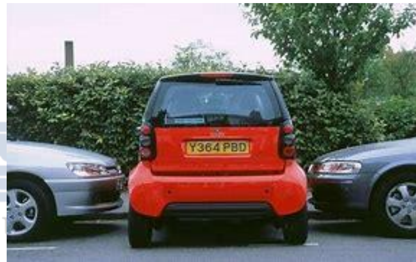
squeeze into a parking space