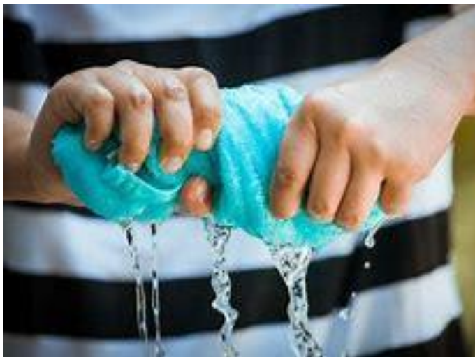
squeeze the water out