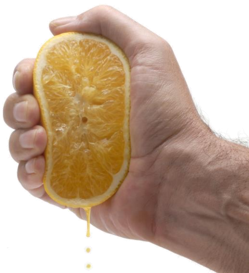
squeeze orange juice