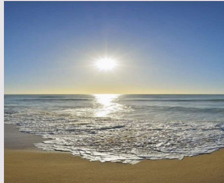
g listering water