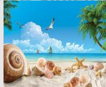
s cattered seashells